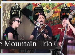
Furnace Mountain Trio