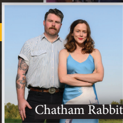
Chatham Rabbits Duo