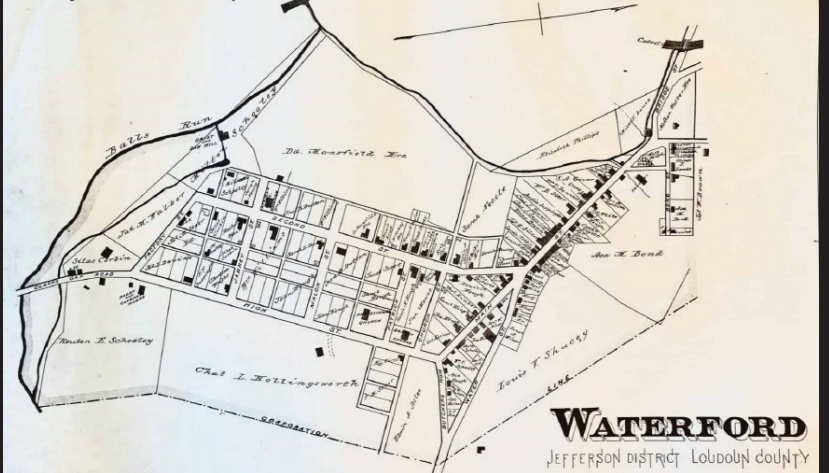
1875 James Oden Map

Reproduction (1965, Melvin Lee Steadman, Jr.) of 1875 James Oden Map showing Waterford (Waterford Foundation).