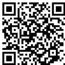
John Wesley Church

Follow the QR code to read more about Waterford history >